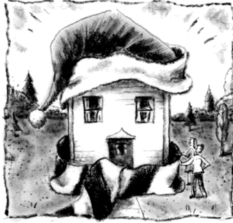
Illustration by Daniel Baxter

Get a free* home energy audit – a $200 value